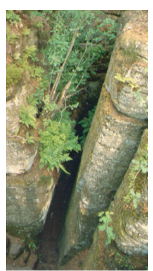
Fig 2. Narrow crevasses like this one contain the last sites of Hymenophyllum tunbrigense in Luxembourg

The area is internationally known for the relictual populations of Tunbridge filmy-fern (Hymenophyllum tunbrigense). This fern was first discovered in this continental island in 1821 but the location of the major colonies remained uncertain until the early 20th century following its re-discovery in 1873. In 1993 the gametophytes of another filmy fern, the Killarney fern (Trichomanes speciosum) were first discovered for continental Europe in the same region. In total 30 fern species (not counting subspecies and/or varieties) are known from this area; more than 90 percent of the species known for Luxembourg, Beside Hymenophyllum tunbrigense and Trichomanes speciosum (for the second species, only gametophytes), rare or interesting species and/or subspecies are Blechnum spicant, Dryopteris affinis, Asplenium csikii (= A. trichomanes subsp. pachyrachis), Polystichum setiferum, Polystichum x bicknelii, ... Unfortunately a certain number of species (for example Osmunda regalis, Asplenium viride, Asplenium billotii and Polystichum lonchitis) are considered to be extinct in the 'Petite Suisse' area. The area offers good conditions for horsetails, especially for Equisetum hyemale and Equisetum telmateia. Considering the clubmosses, from the 5 known species for the area, 4 are considered to be extinct, and the status of Huperzia selago is rather unknown.