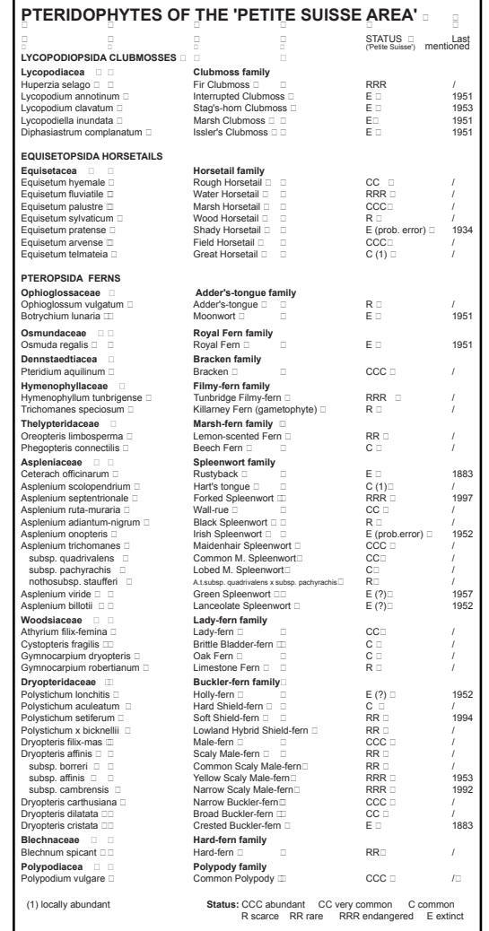
Tabl 1. List of species and status of the pteridophytes known from the 'Petite Suisse' sandstone area in Luxembourg.